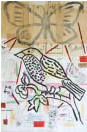
Talking Pictures : Parts of a butterfly Jaune Quick-to-See Smith Print making 1994