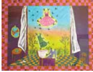
The Only Purance is Change Hollis Sigler Color Lithography 1995