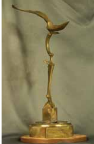
Global Wings Richard Hunt Bronze Sculpture 1992

Administration Building Presidents Office Foyer