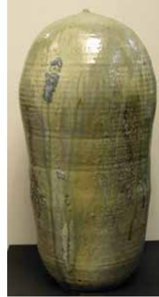
Untitled Toshiko Takaezu Ceramics 1998

Administration Building Presidents Office Foyer