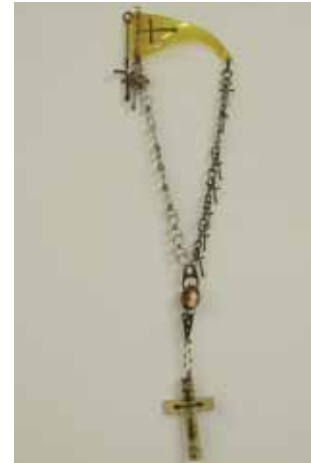
Untitled Robert Ebendorf Jewelry & Enamelling 2001

1st Floor Visual Arts Building Front Foyer