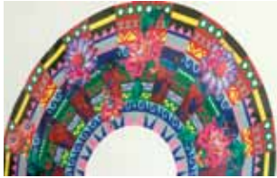
In Heat the Middle of Winter Miriam Schapiro Print making 2001