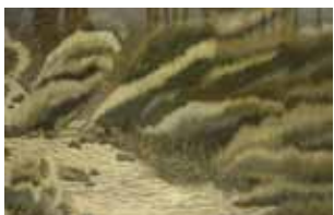
Untitled Japanese Textile 18 th century