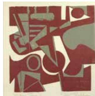
Modern Times Robert Blackburn Print making 1970