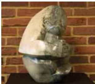
Untitled Zimbabwean Artist Sculpture na